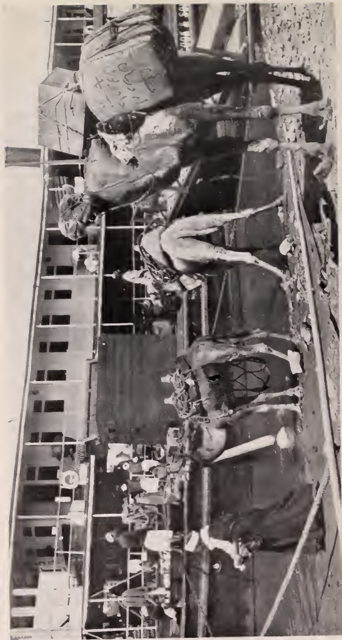
Loading an up-to-date Nile steamer from the backs of "ships of the desert"